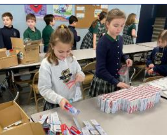
(Below) Students packing "blessing bags" for the needy in our community.