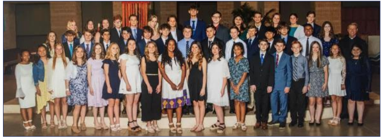
(Above) Students from St. Clare and St. Nicholas parishes celebrating their Confirmation.

May the gifts of grace and the Holy Spirit be rooted deeply in the hearts of our 2nd and 8th graders and carry them throughout their lives.