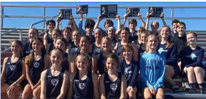
(Above) St. Clare athletes won the Diocesan Track and Field Title. Junior Boys, Parochial Girls, and Parochial Boys all won their divisions while the Junior Girls finished a close second.