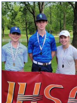
(Right) St. Clare student athletes at the State Golf Championship in Rend Lake. All 3 received a medal for finishing in the top 15 at State.