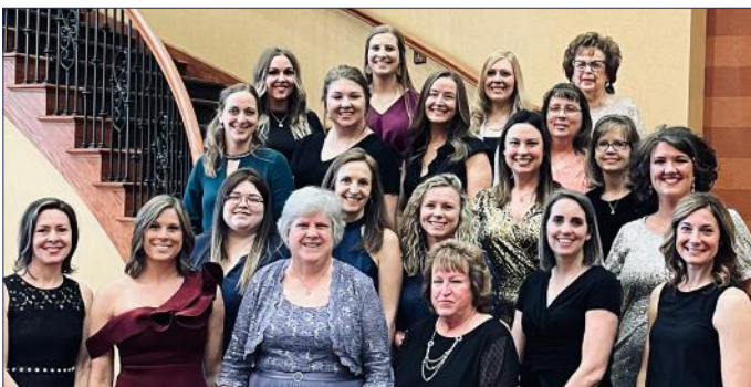
(Below) St. Clare faculty and staff commemorating this year’s auction festivities.