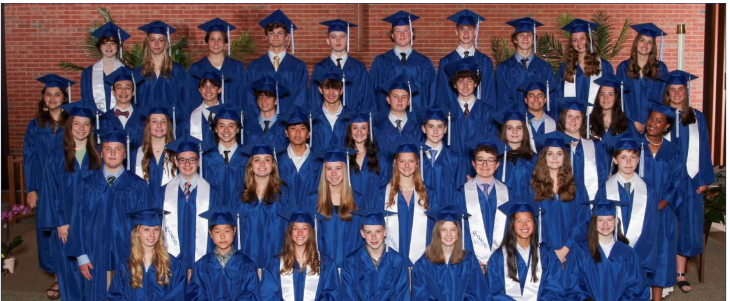
(Above) St. Clare Graduates, Class of 2022.