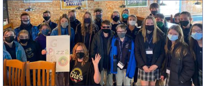
(Above) Seventh and eighth graders helping at the Empty Bowl Luncheon.