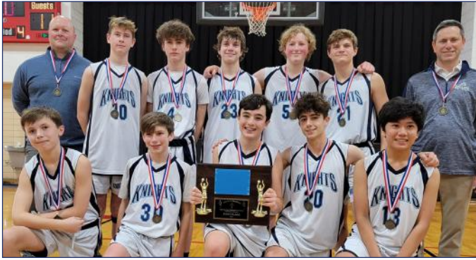
(Above) Parochial Boys basketball team earned first place in the Diocesan championship.