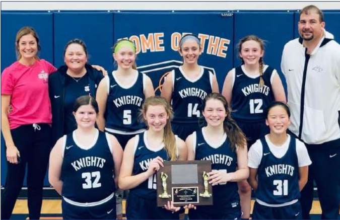
(Below) Parochial Girls basketball team earned first place in Diocesan championship.