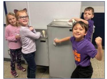
(Above) Knights give back to their St. Clare community by cleaning the school and chapel.