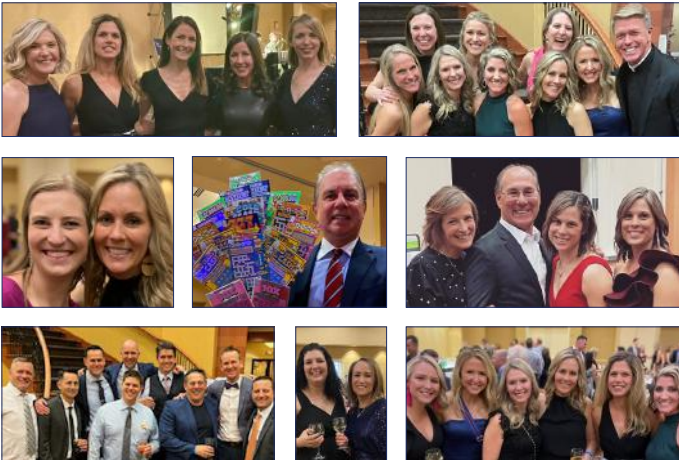
(Above) Auction supporters enjoying our first live event since 2020.