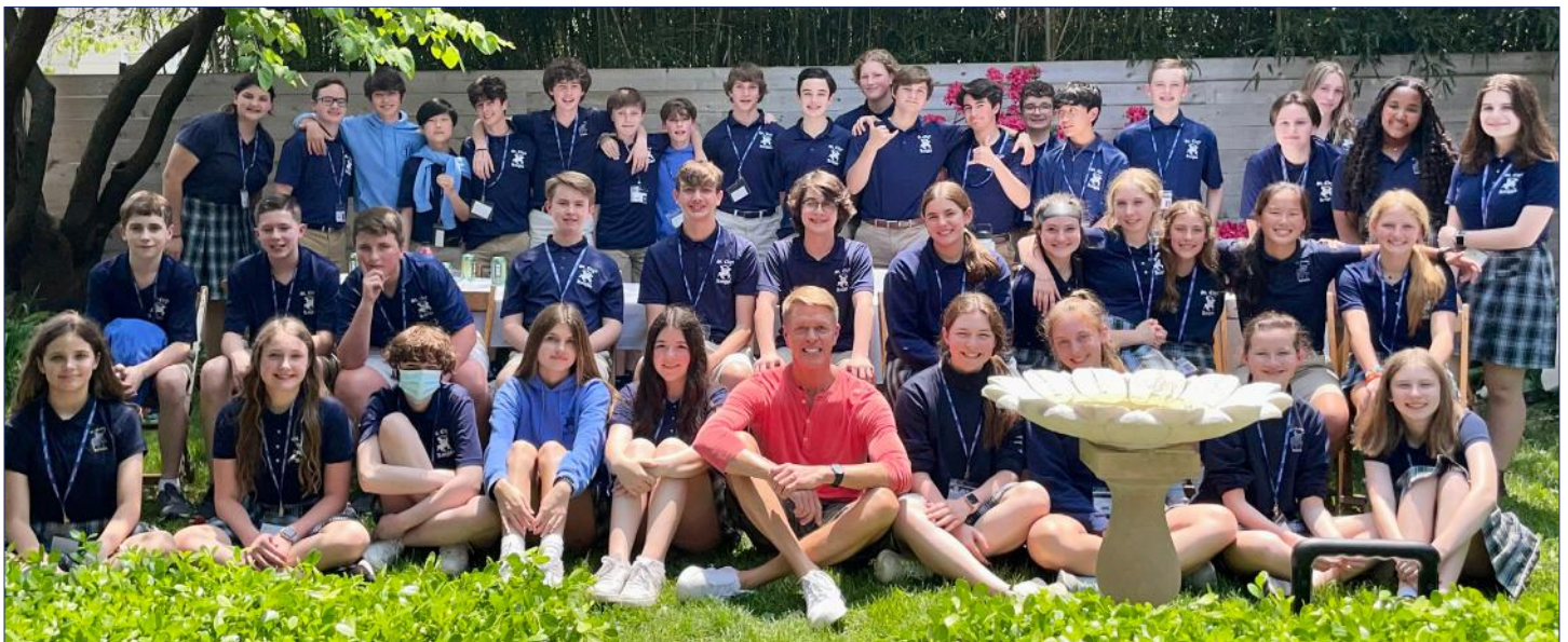
(Above) Eighth Grade Graduates